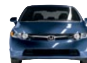
Royal Blue Pearl