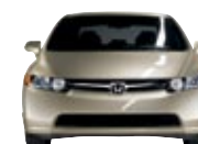
Borrego Beige Metallic