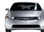
Alabaster Silver Metallic