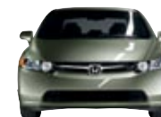
Green Tea Metallic