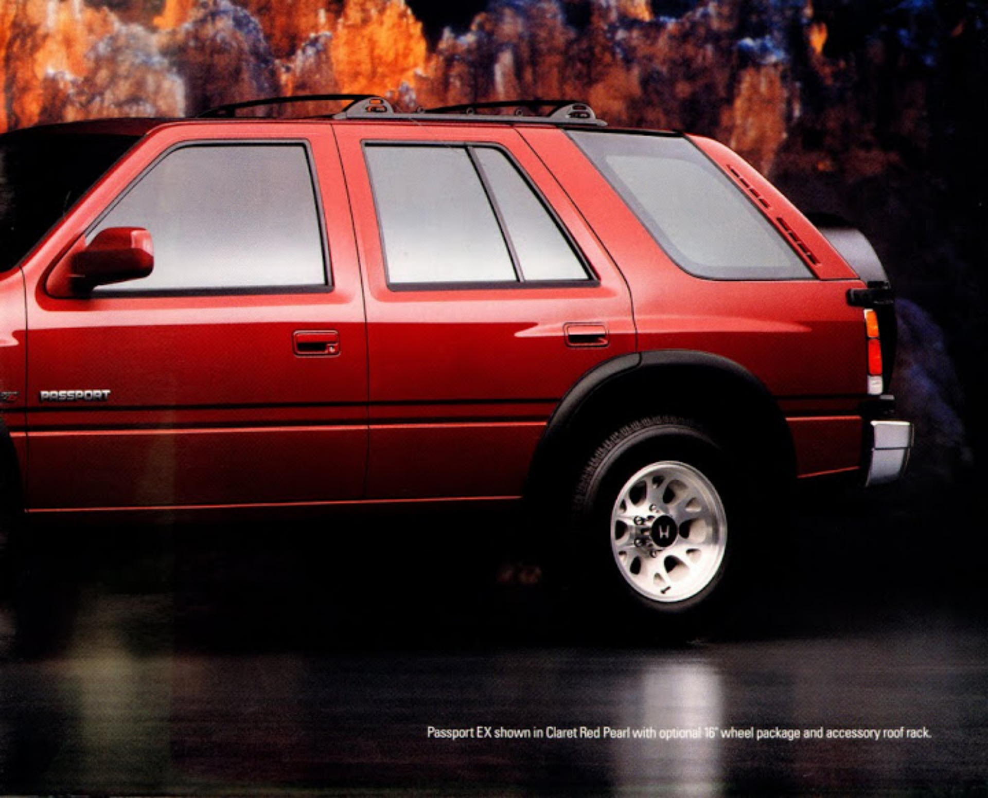
Passport EX shown in Claret Red Pearl with optional 16" wheel package and accessory roof rack.