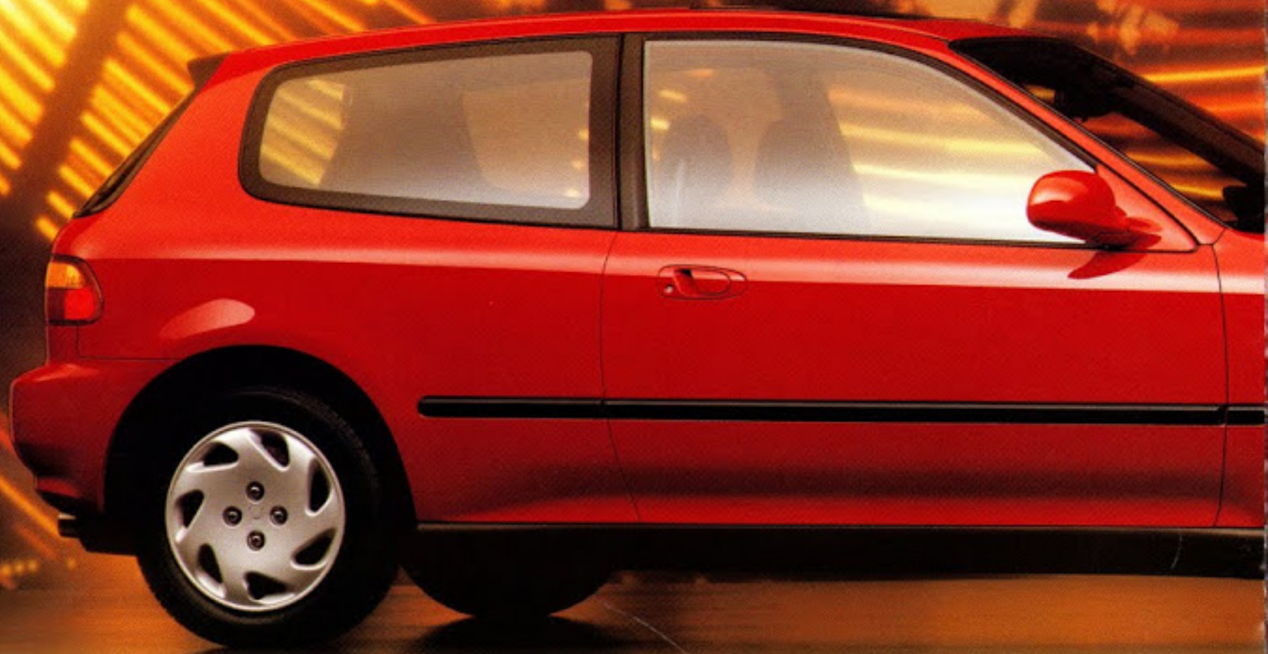
Civic Si shown in Milano Red.