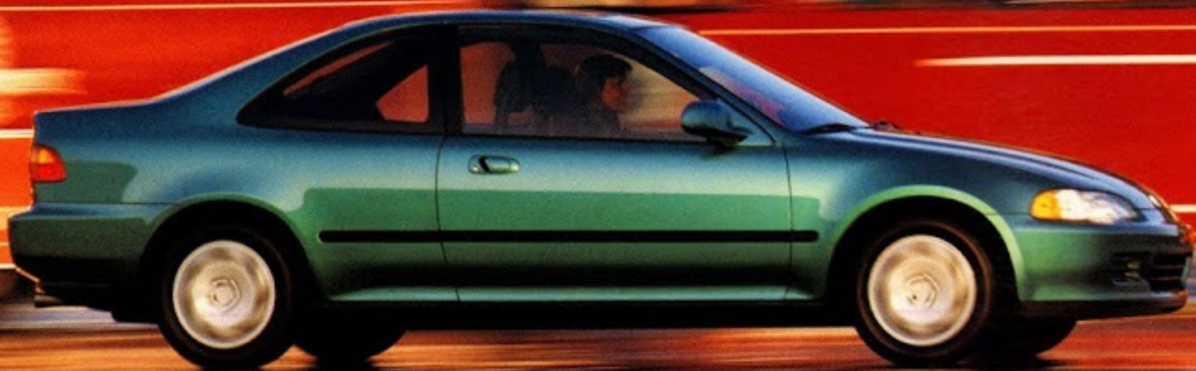
Civic EX Coupe shown in Aztec Green Pearl.