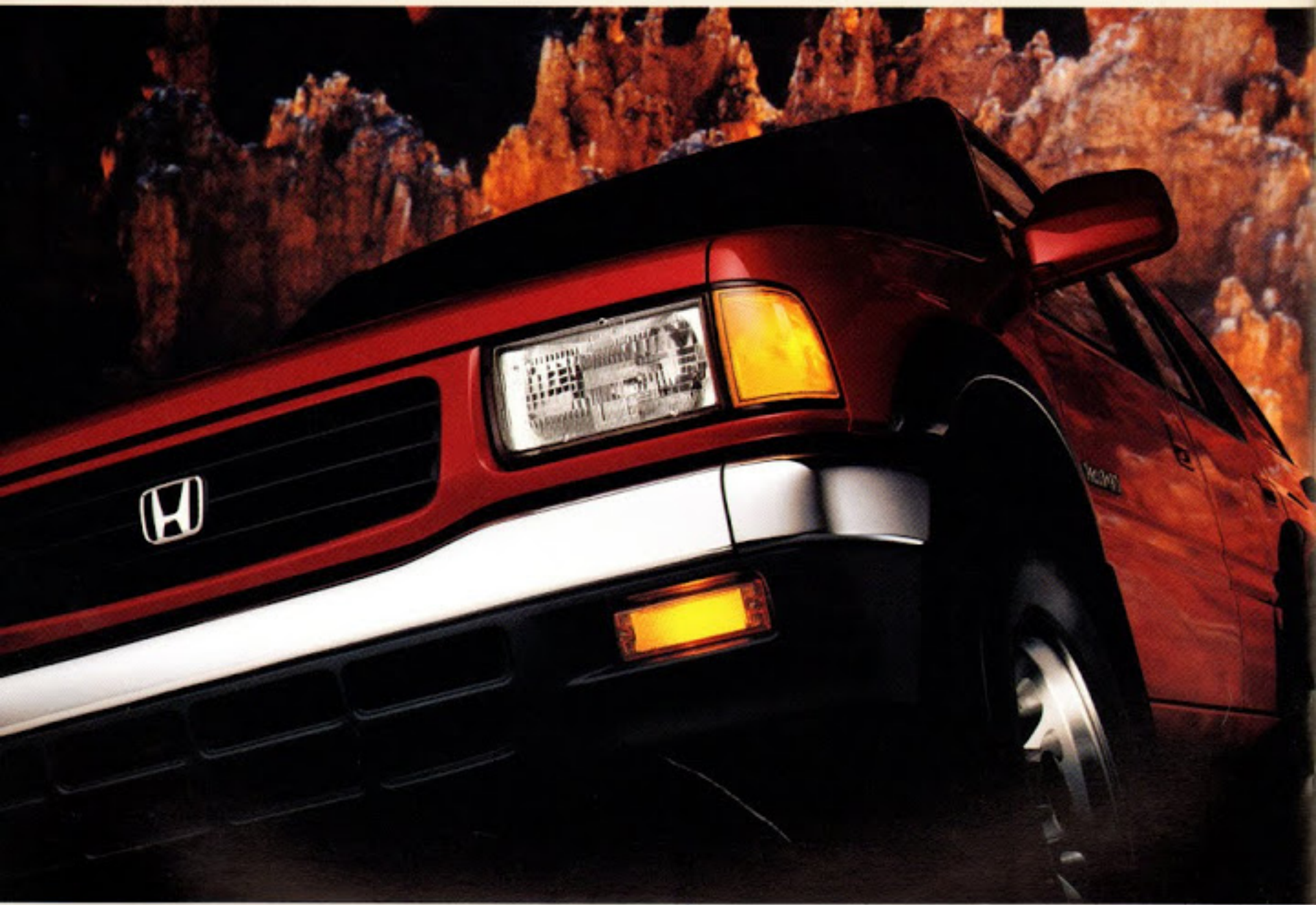
Passport EX shown in Claret Red Pearl with optional 16" wheel package.