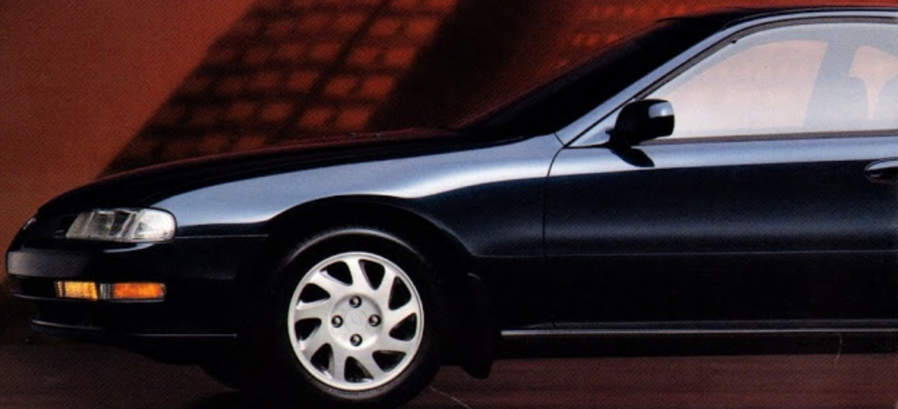
Prelude VTEC shown in Azure Blue-Green Pearl.