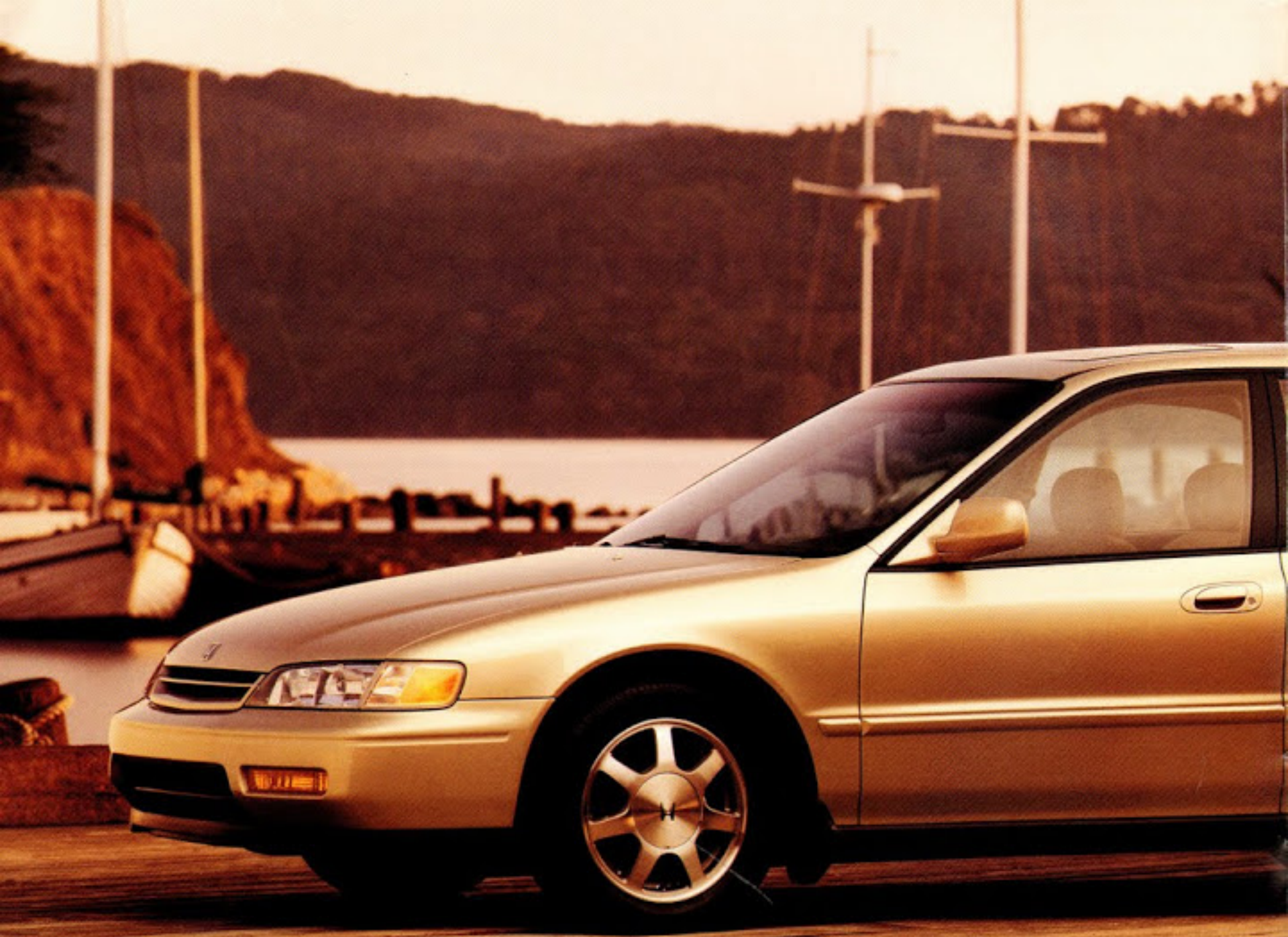
Accord EX Wagon shown in Cashmere Metallic.