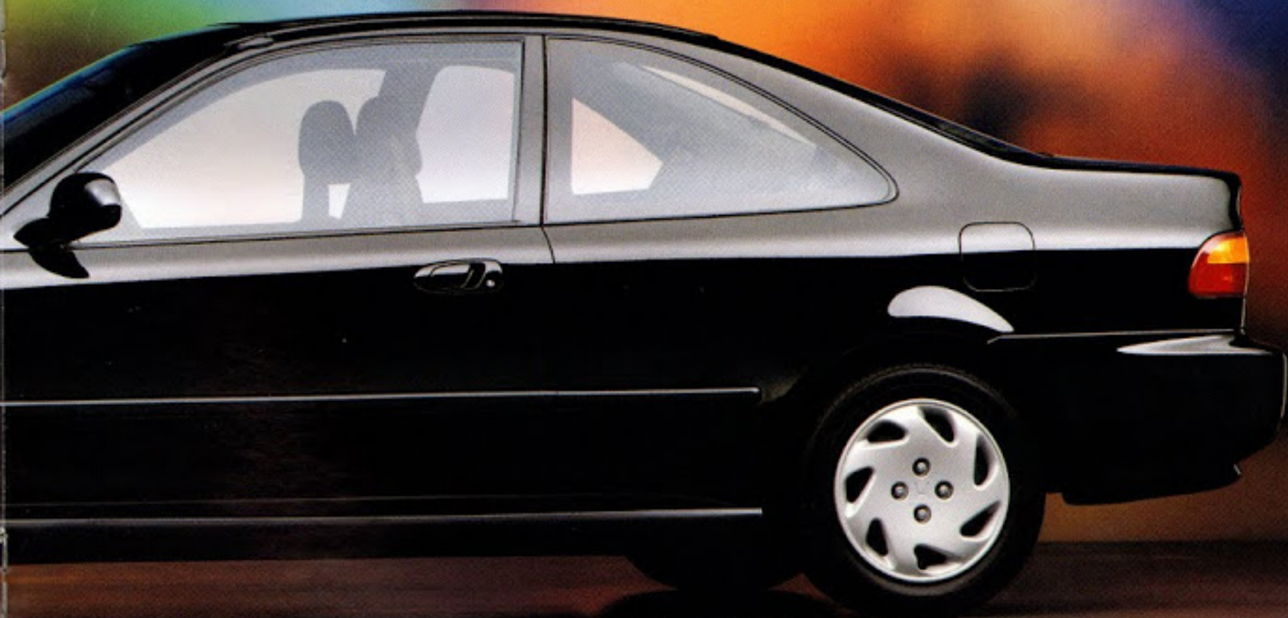
Civic EX Coupe shown in Granada Black Pearl.