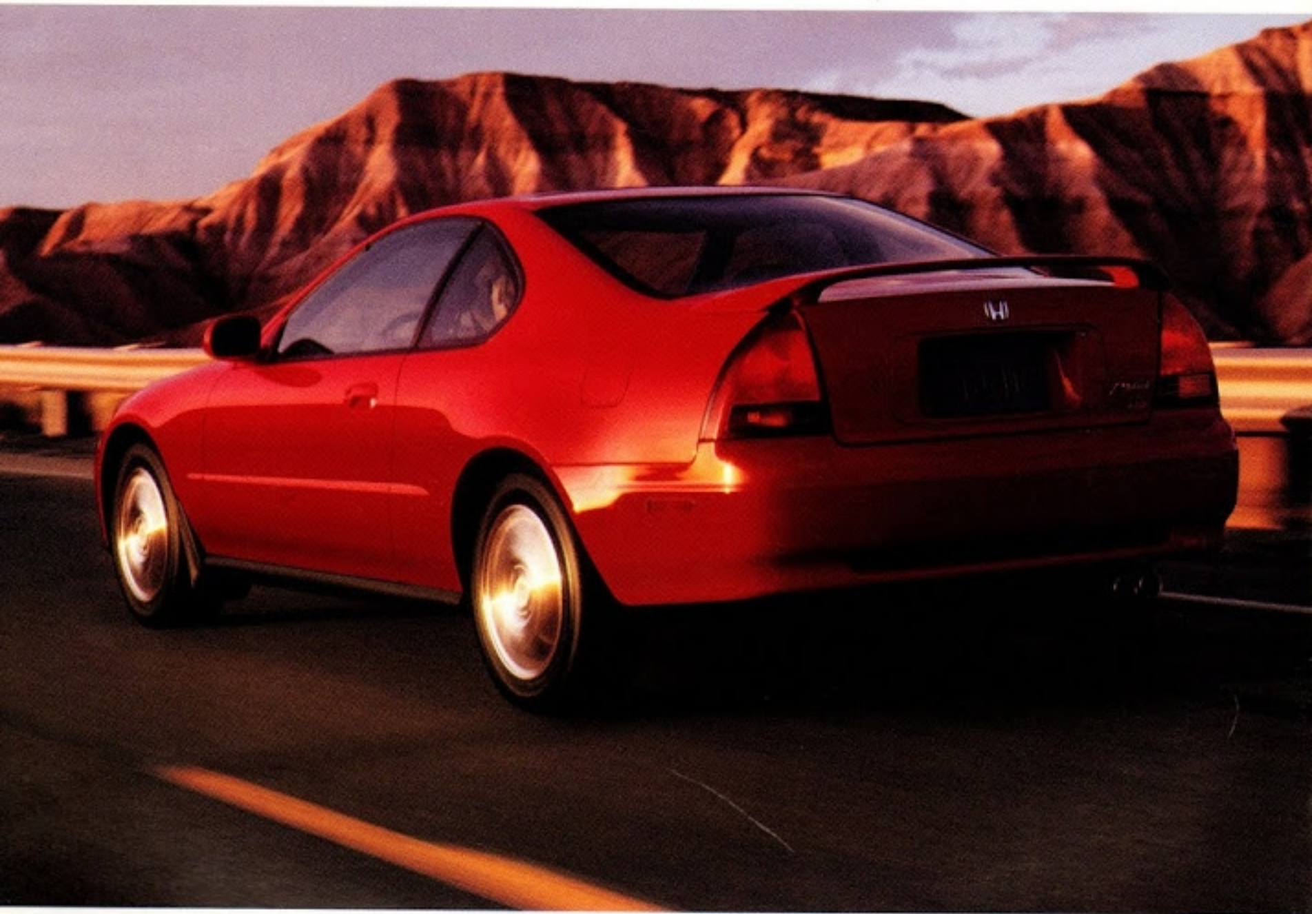
Prelude 4WS shown in Milano Red.