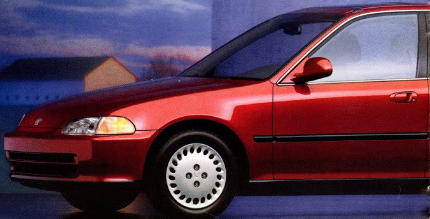
Civic EX Sedan shown in Torino Red Pearl.