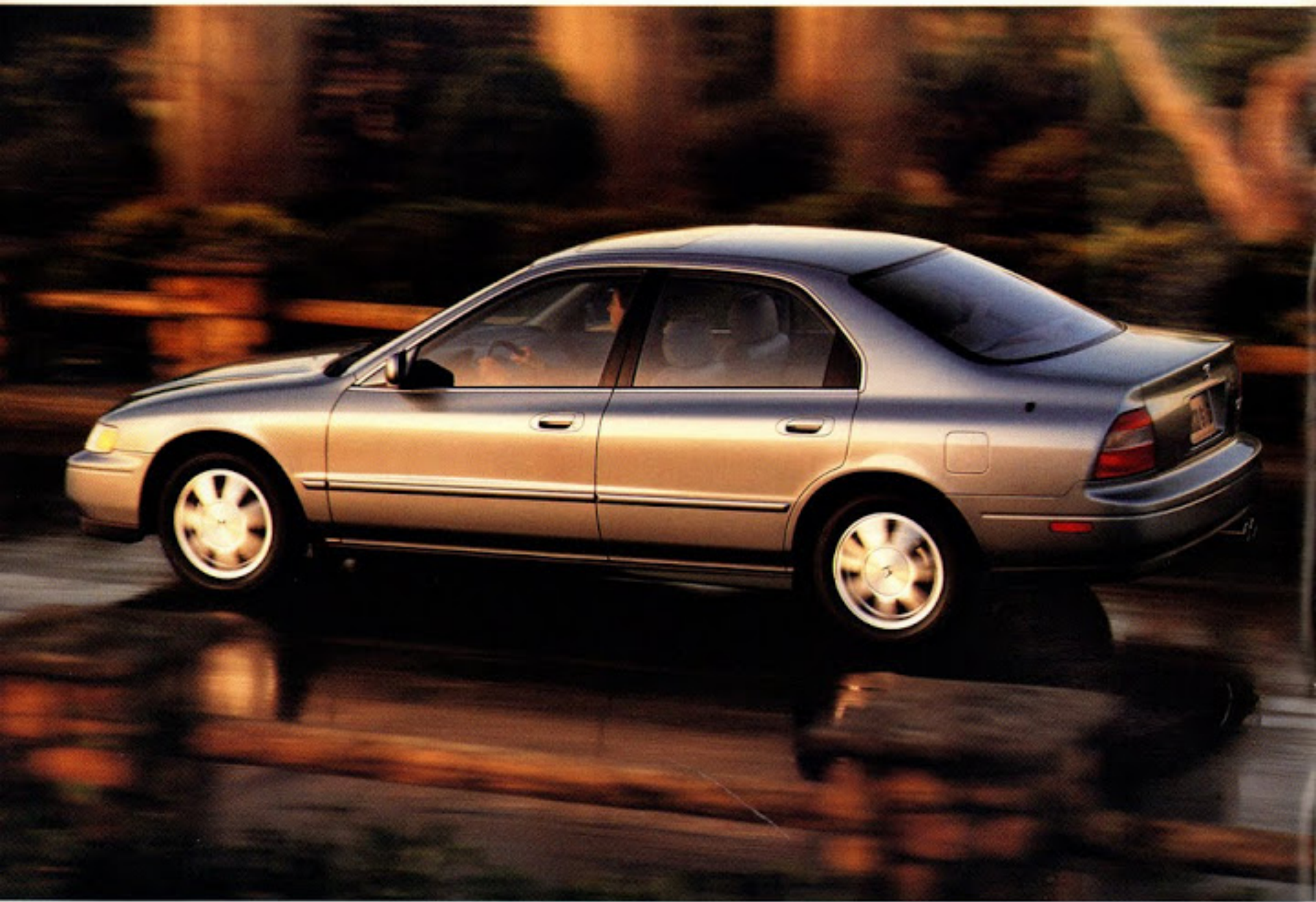
Accord EX Sedan shown in Sage Green Metallic.