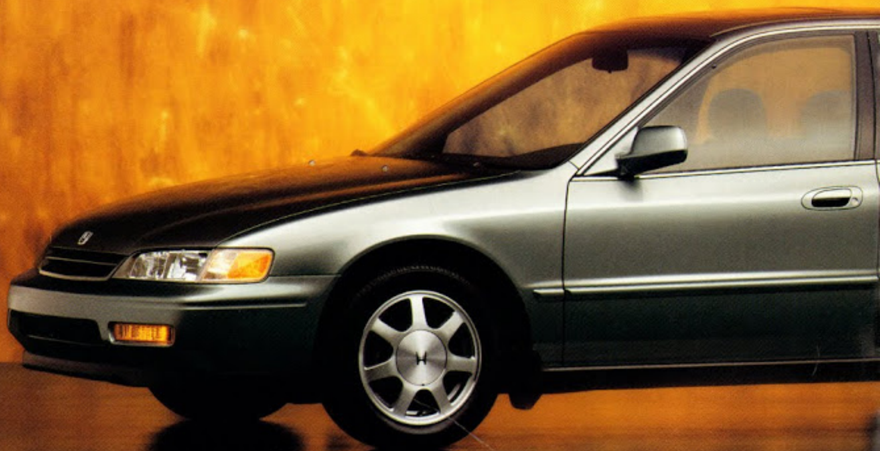
Accord EX Sedan shown in Sage Green Metallic.