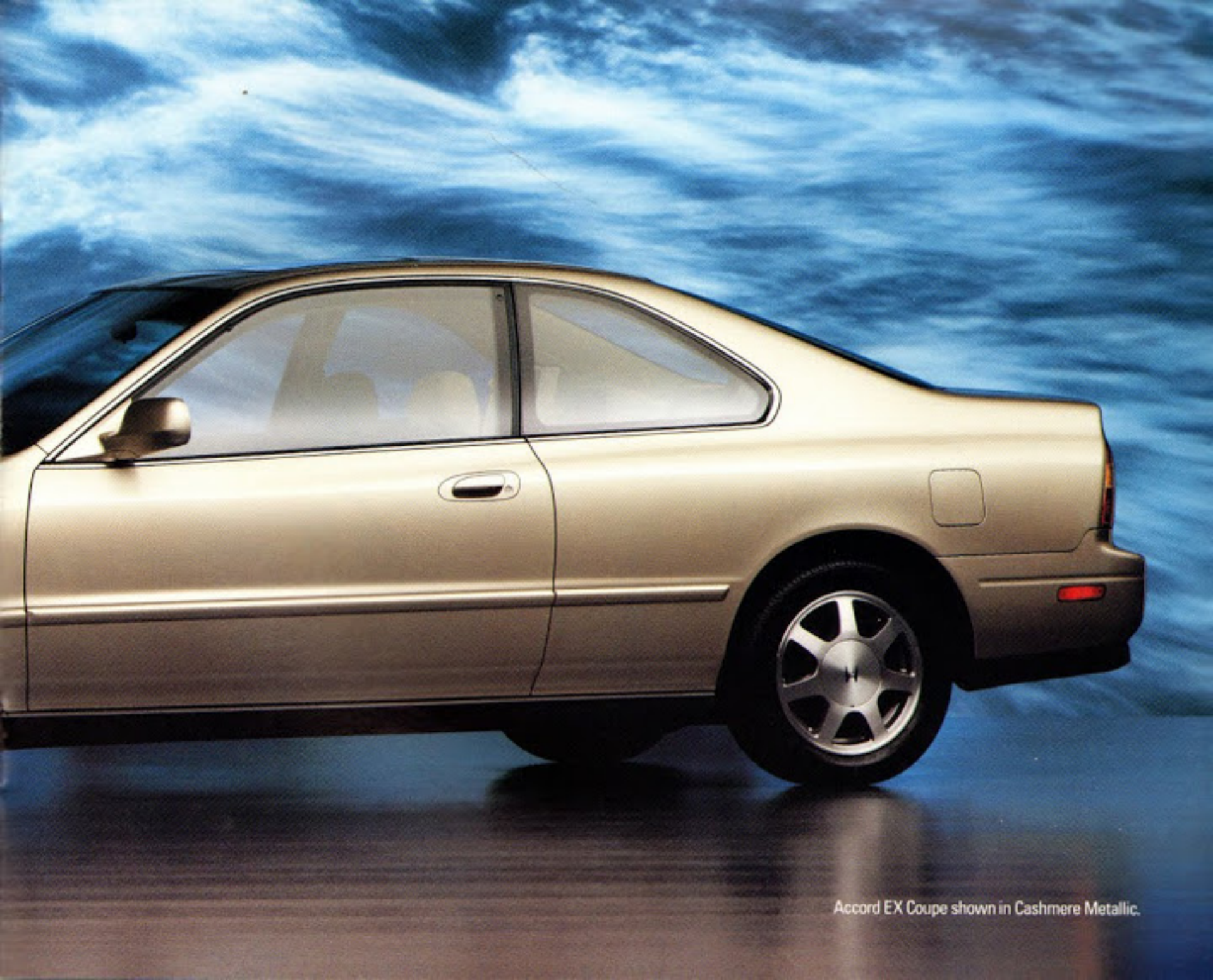
Accord EX Coupe shown in Cashmere Metallic.