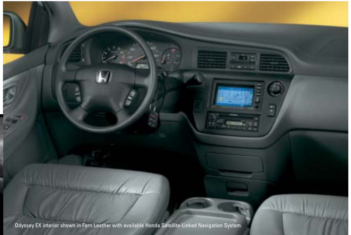
Odyssey EX interior shown in Fern Leather with available Honda Satellite-Linked Navigation System.

Clear the way. You can operate as many as three different items with the HomeLink remote system that comes standard on EX models. So you can open a garage door or an electric gate safely from inside your Odyssey.