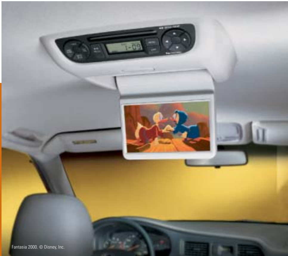
Fantasia 2000. © Disney, Inc.

Movies, music and more. Honda vehicles have always been entertaining to drive. But the Honda DVD Entertainment System with remote (available on select EX models) takes fun to a new level. The system features a ceiling-mounted 7-inch LCD screen that flips out of the way when not in use. For convenience, the system can be operated by separate controls in the front and the rear as well as by remote control. For the benefit of rear passengers, two sets of wireless headphones are standard as are three jacks for wired headphones. Best of all, front-seat occupants can listen to the audio system while those in back can separately enjoy a DVD or CD, or play a video game.