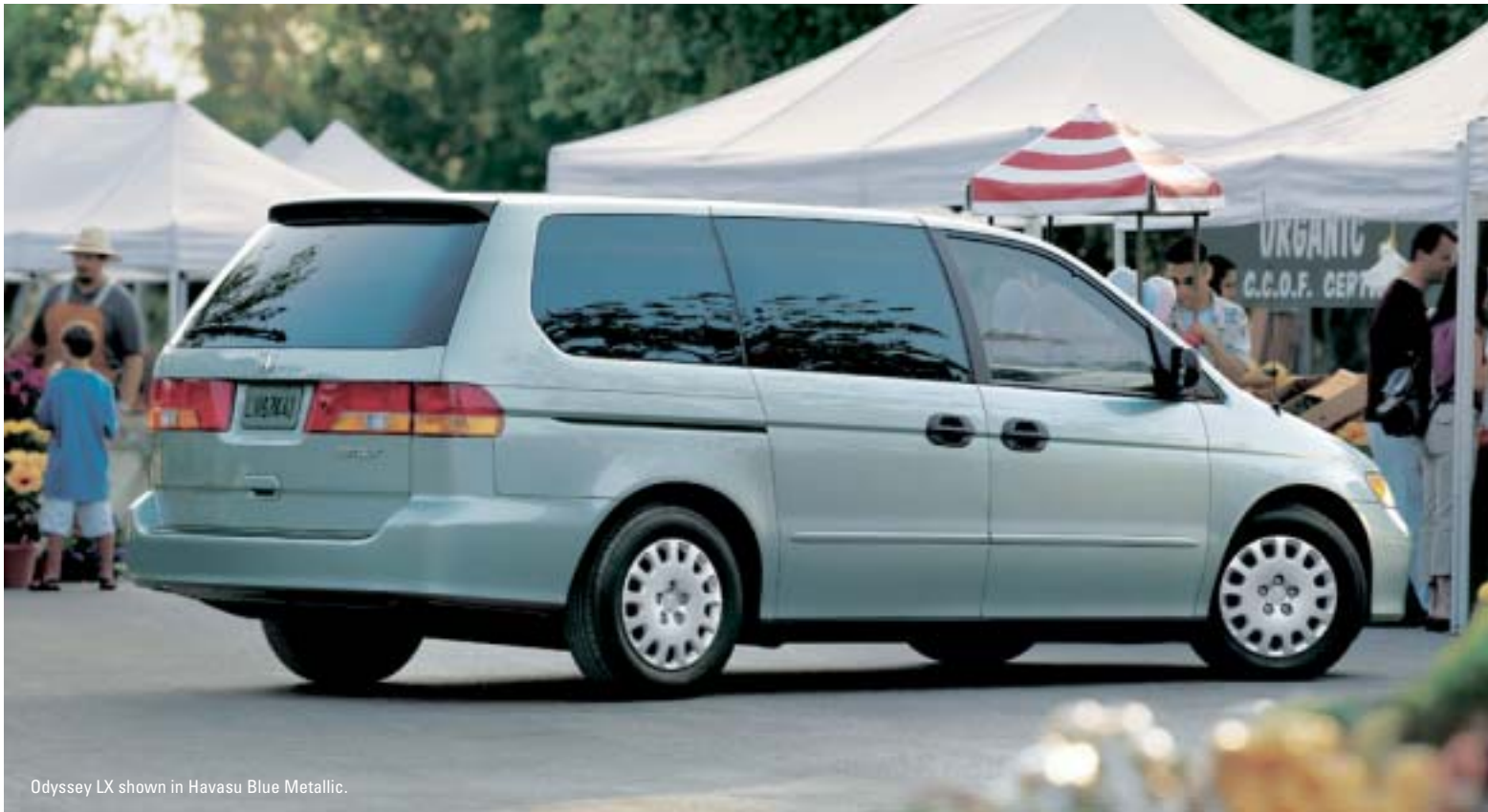
Odyssey LX shown in Havasu Blue Metallic.