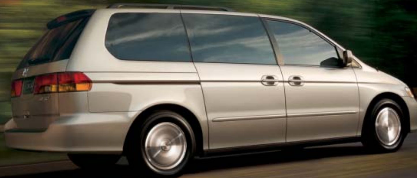
Odyssey EX shown in Sandstone Metallic.

What separates the Odyssey from all other minivans is the driving experience. That's true with every Honda, but responsive handling and good reserves of power are things you don't usually associate with a minivan. Motivated by a 240-hp SOHC VTEC ® V-6 engine and a smooth-shifting 5-speed automatic transmission, Odyssey brings you the kind of performance usually reserved for sporty sedans. With the 4-wheel independent suspension and precise steering, Odyssey can move you in ways you never expected in a minivan.