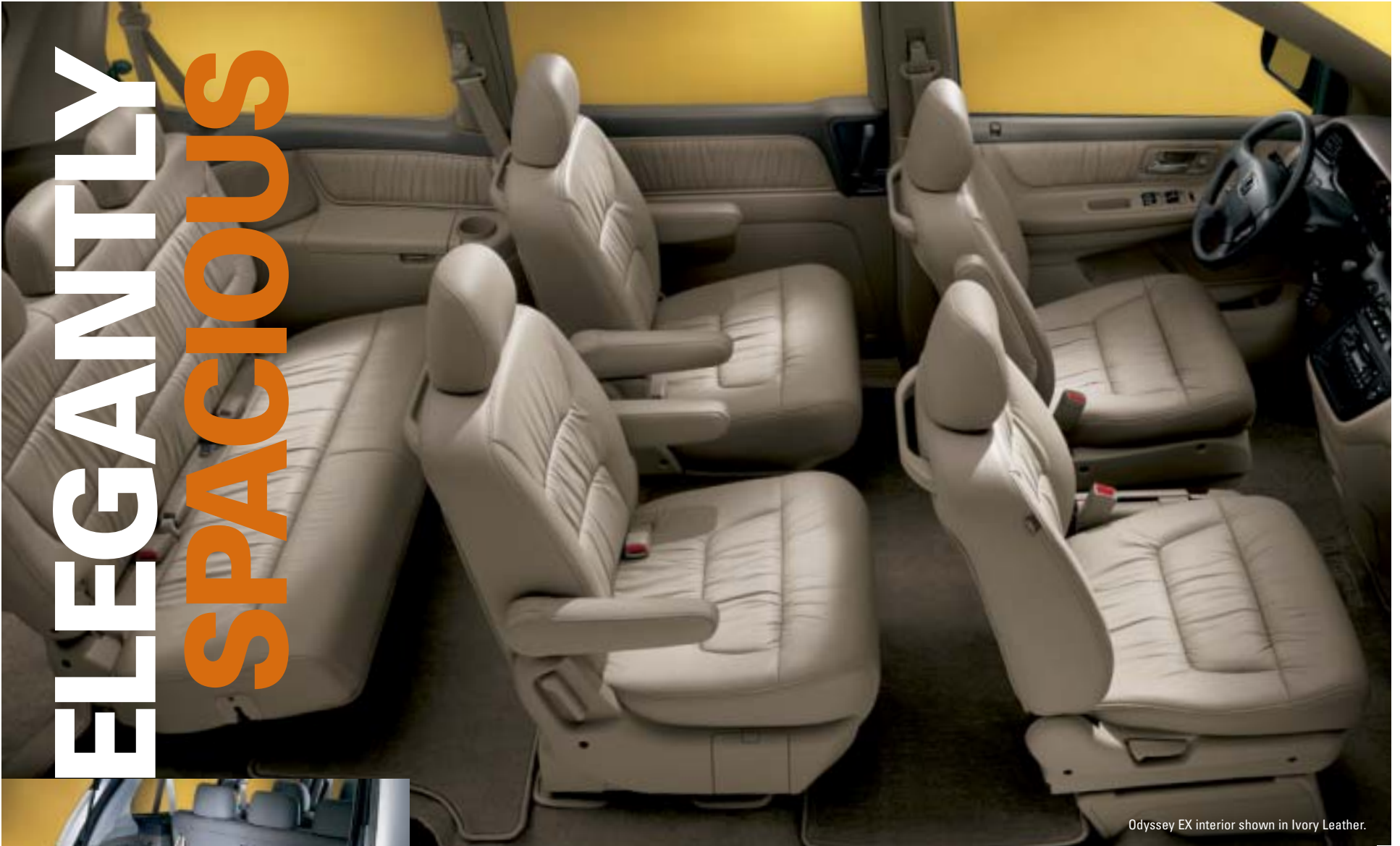
Odyssey EX interior shown in Ivory Leather.