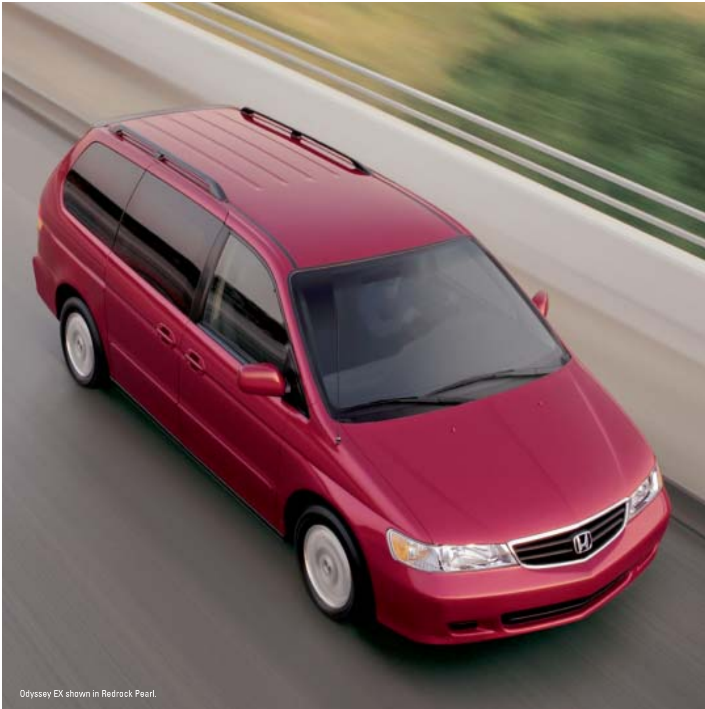
Odyssey EX shown in Redrock Pearl.