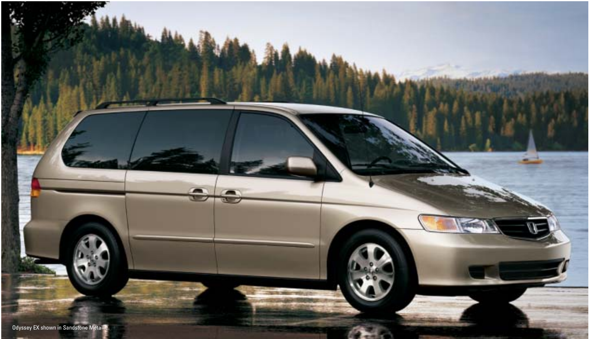
Odyssey EX shown in Sandstone Metallic.

For decades, Honda has been a leader and an innovator in creating environmentally conscious technology. From pioneering stratified-charge engines of the 1970s to our current designs, concern for the planet has always been a top priority. So it's no surprise that for 2003, every Honda vehicle meets or surpasses federal LEV (Low-Emission Vehicle) standards. And that includes the truly inspiring 240-hp Honda S2000. But we don't stop there. Honda is still the only automaker to have two gas/electric hybrids on the market in the U.S.