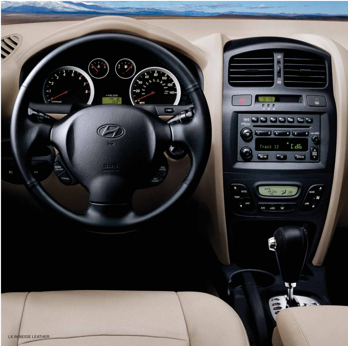
LX IN BEIGE LEATHER