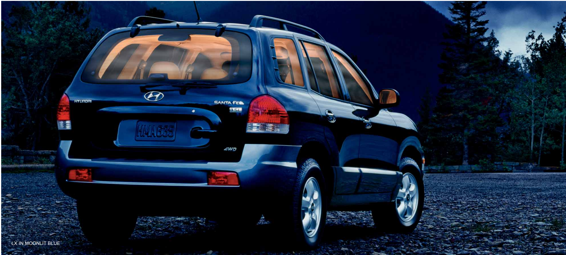
LX IN MOONLIT BLUE