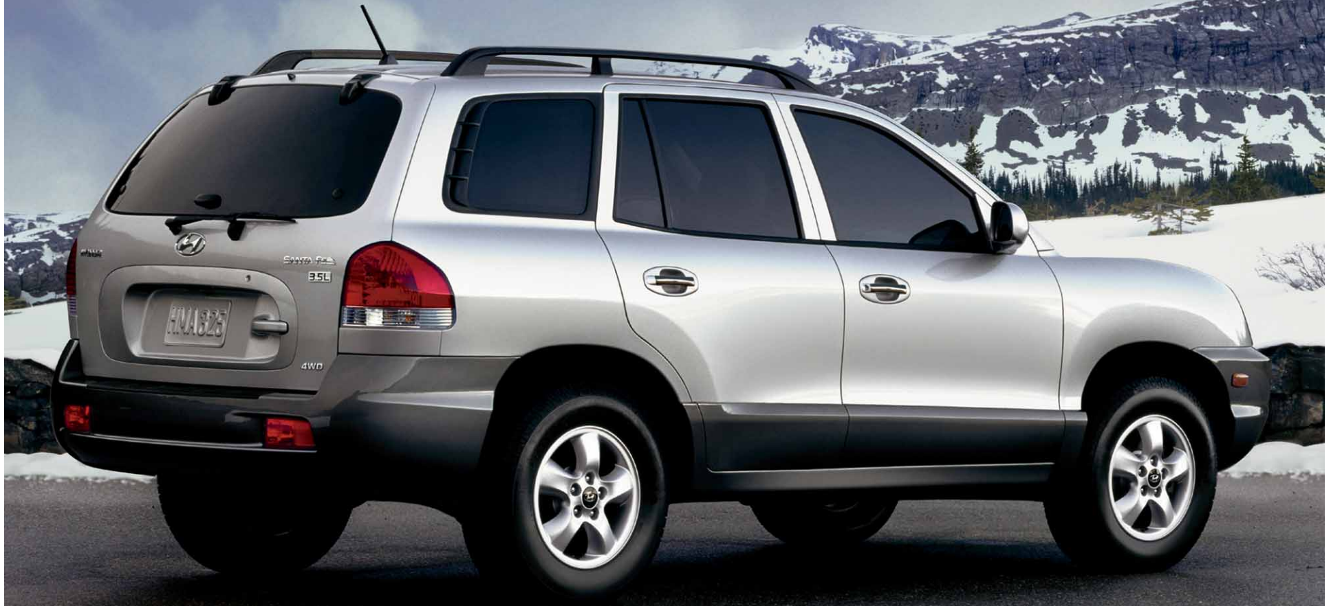
LX IN PEWTER