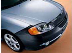
PROTECT YOUR INVESTMENT AND YOUR TIBURON'S HANDSOME FINISH WITH A HIGH-QUALITY FRONT NOSE MASK.