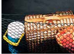
SECURE LOOSE ITEMS WITH THIS HANDY TRUNK CARGO NET FOR PEACE OF MIND.