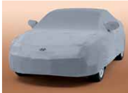
KEEP YOUR CAR UNDER WRAPS WITH A WEATHER-REPELLENT CAR COVER THAT FITS THE TIBURON PRECISELY, RAIN OR SHINE.

If you'd like to customize your Tiburon, please see your Hyundai dealer for the full line of Hyundai accessories. You should always use genuine Hyundai parts and accessories, which meet strict standards for quality and durability.