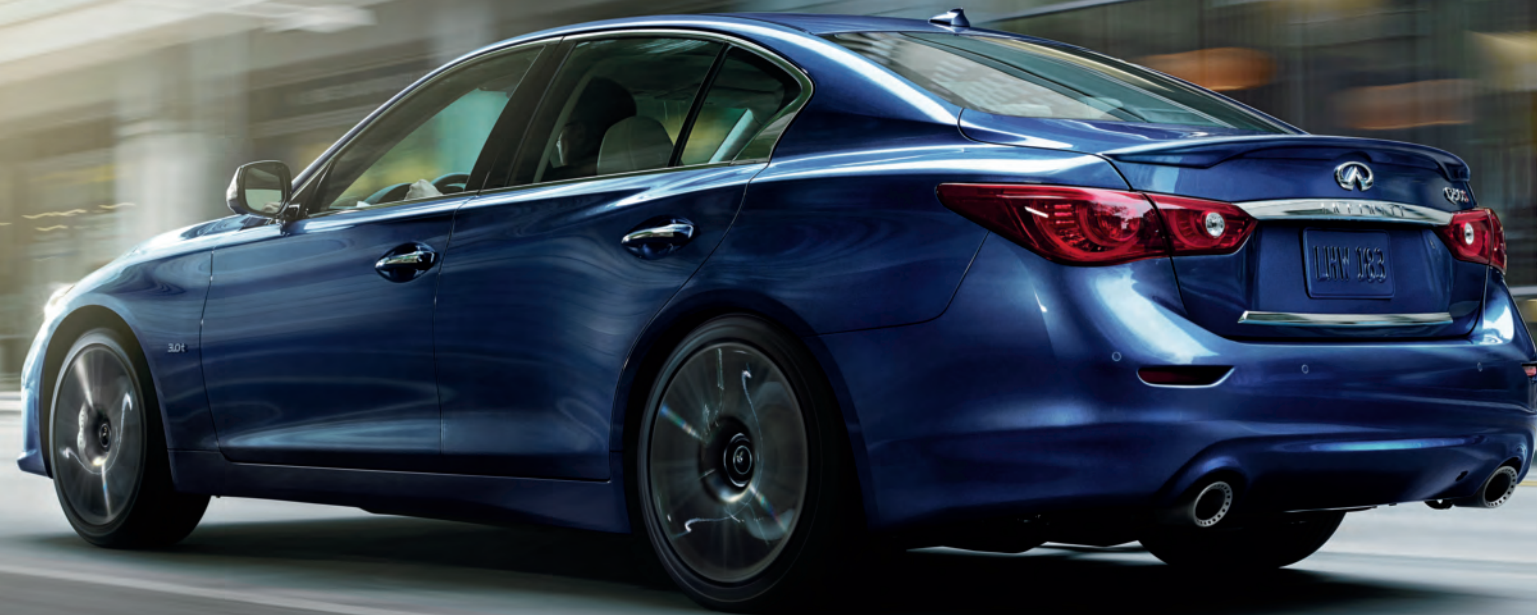
Vehicle shown with accessory rear decklid spoiler.

KEEP YOUR DISTANCE Distance Control Assist 1,7 looks ahead and warns you if your following distance becomes too short. If detected, and you do not take your foot off the accelerator pedal, the system will partially engage the brakes and push back on the accelerator pedal.