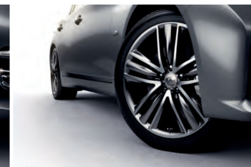
19 X 8.5-INCH, TRIPLE 5-SPOKE ALUMINUM-ALLOY WHEELS WITH ALL-SEASON OR SUMMER RUN-FLAT PERFORMANCE TIRES*