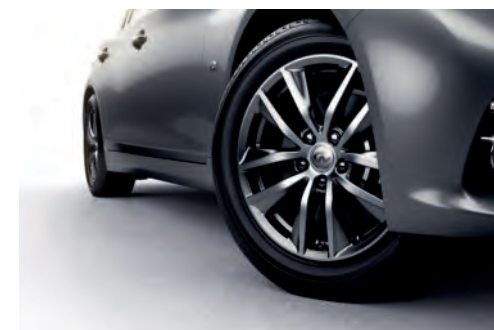
17 X 7.5-INCH, SPLIT 5-SPOKE ALUMINUM-ALLOY WHEELS WITH ALL-SEASON RUN-FLAT PERFORMANCE TIRES