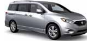
SL: REWARDS FOR EVERYONE