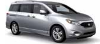
LE: RALLIES AROUND YOU