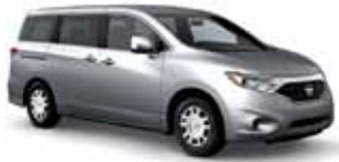
S: BEYOND THE ORDINARY