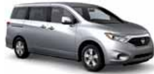
SV: MORE CONVENIENCE