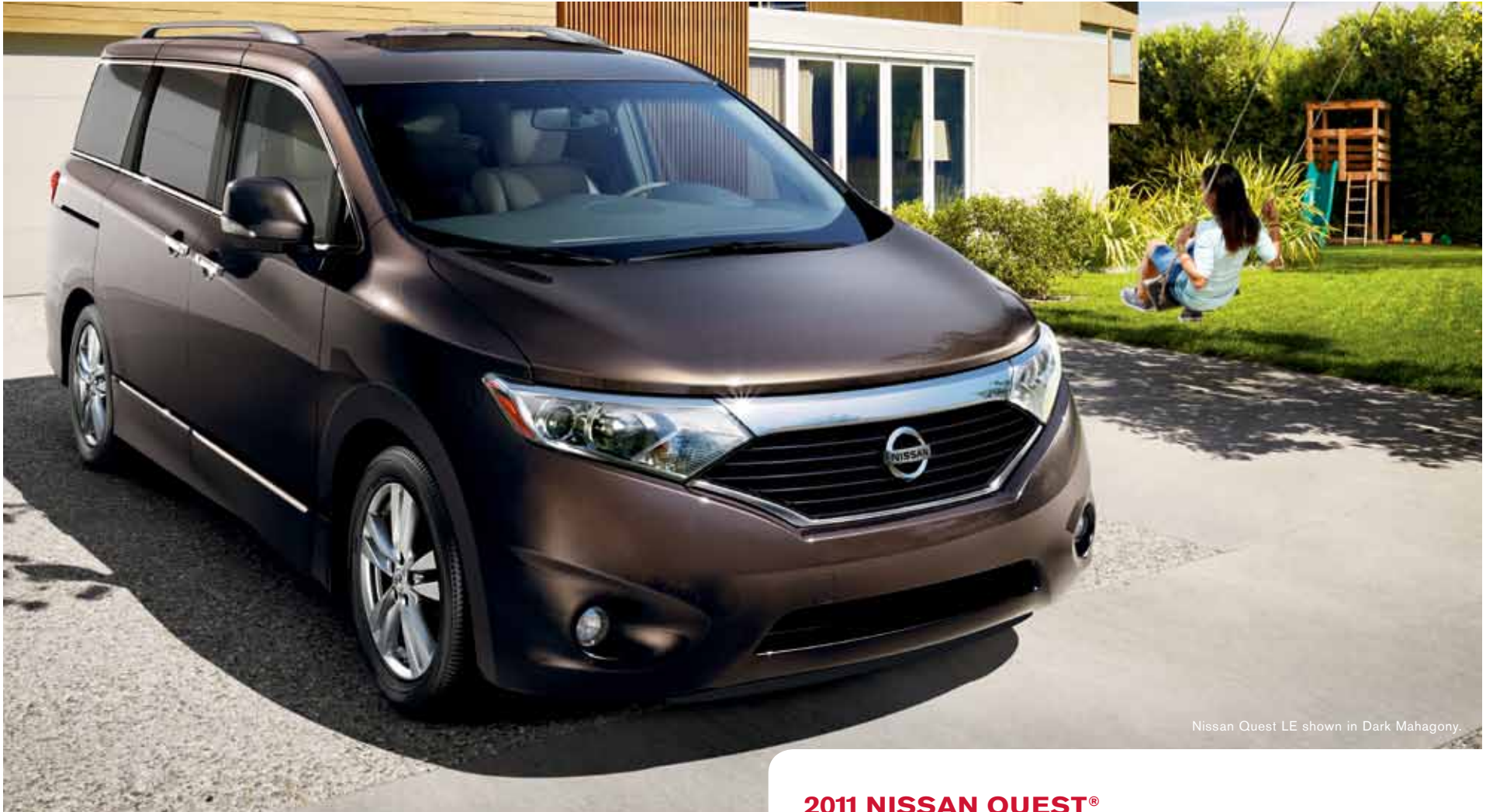
Nissan Quest LE shown in Dark Mahogany.