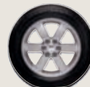
17" Standard Alloy (RELAY-3)

1 Cargo and load capacity limited by weight and distribution. 2 Maximum trailer ratings are calculated assuming a properly equipped base vehicle plus driver. The weight of other optional equipment, passengers and cargo will reduce the maximum trailer weight your vehicle can tow. See your retailer for details. 3 Based on EPA estimates. 4 Remote engine start not standard on RELAY-3. 5 Foldaway tray not available on RELAY-1. 6 Separate rear climate controls not available on RELAY-1. 7 17-inch alloy wheels standard on RELAY-3. 8 See inside back cover for important information about air bags, including a note about child safety. 9 Call 1-888-4ONSTAR (1-888-466-7827), visit onstar.com and see inside back cover for system limitations and details. 10 Navigation map covers the 48 contiguous United States and portions of Canada, but does not cover Alaska, Hawaii, Puerto Rico or the Virgin Islands. 11 Available in the 48 contiguous United States. Service fees apply. Visit gm.xradio.com for system details.