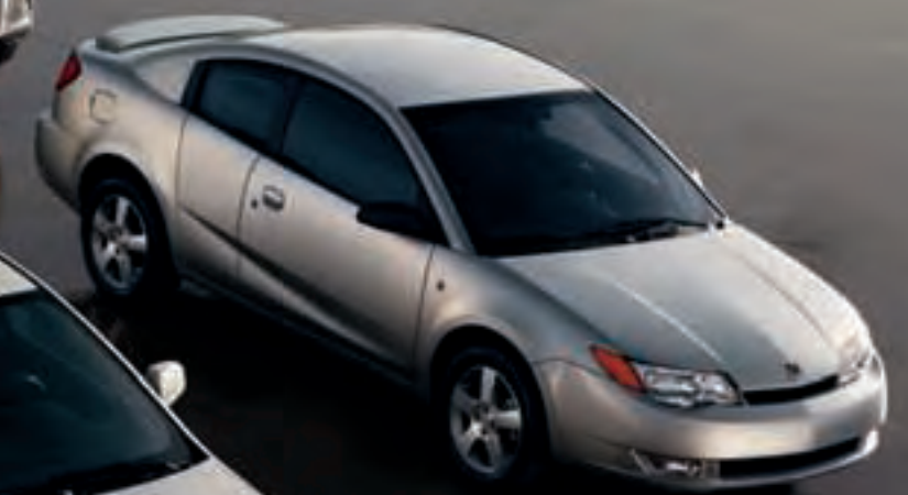
ION quad coupe