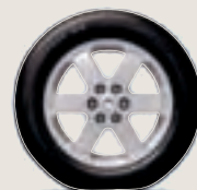
17" Available Alloy (RELAY-2)