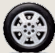
17" Standard Cover (RELAY-1 & 2)