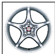
GT-S standard 15" aluminum alloy wheel GT-S available 16" aluminum alloy wheel