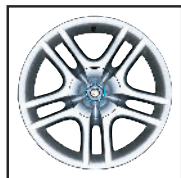
GT standard 15" wheel cover GT available 15" aluminum alloy wheel