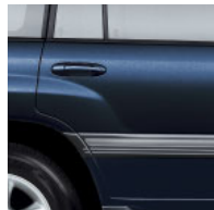
Atlantis Blue Mica WITH IVORY OR SHADOW GRAY INTERIOR