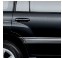
Black WITH IVORY OR SHADOW GRAY INTERIOR