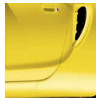
Solar Yellow with Black fabric or Black leather interior