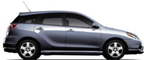
XR 2WD 4-Speed Automatic (1912) MSRP** Starting At: $17,820.00