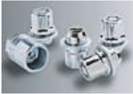
Alloy Wheel Locks $65.00