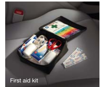
First aid kit