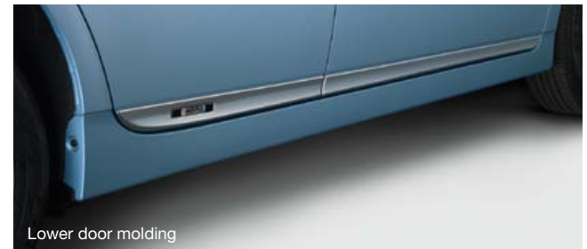
Lower door molding

See numbered footnotes in Disclaimers section.