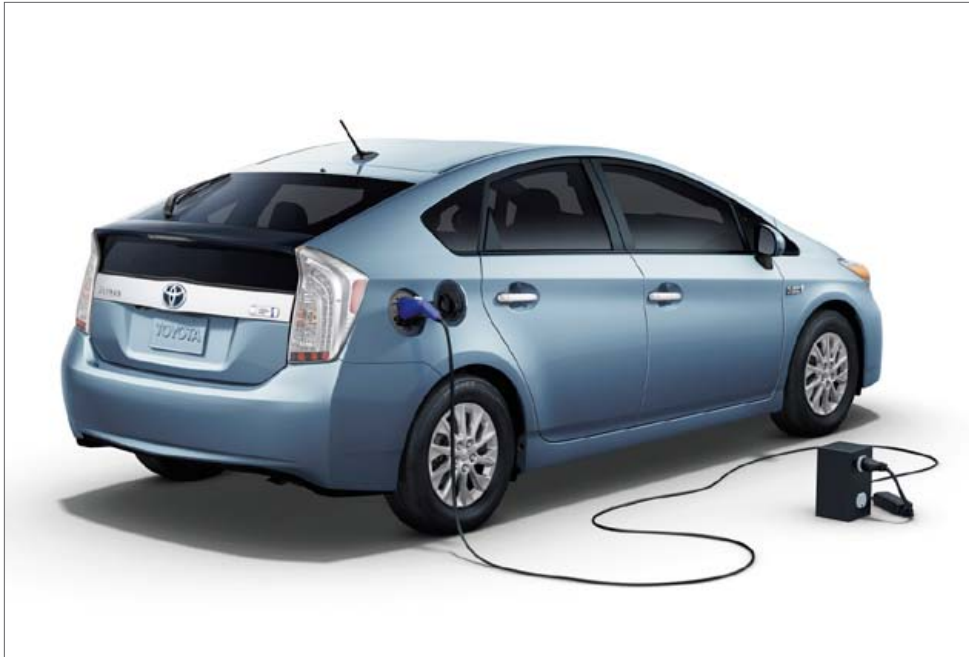
Prius Plug-in Hybrid Advanced shown in Clearwater Blue Metallic.