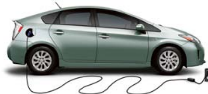
SEA GLASS PEARL