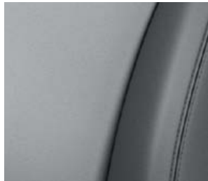
SOFTEX TRIM in Dark Gray