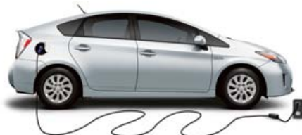
CLASSIC SILVER METALLIC