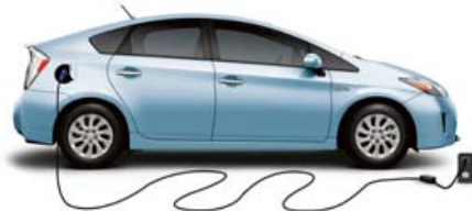
CLEARWATER BLUE METALLIC