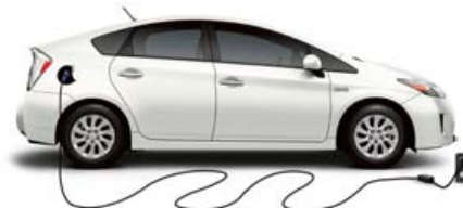
BLIZZARD PEARL 1