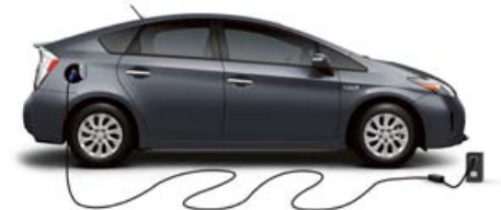
WINTER GRAY METALLIC