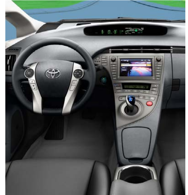
Interior shown with Dark Gray SofTex-trimmed seats.

The Prius Plug-in Hybrid is engineered for dedicated electric driving capability that can let you travel up to 62 mph on electric power alone and is rated to drive up to 11 miles 1 while in EV 2 Mode. It also features a quick three-hour charge time from a standard 120V AC household outlet, 3 while a 240V outlet* will charge it in about half that time. During EV Mode driving, the Prius Plug-in is rated at 95 mpg 4 , and if you run out of electric charge, the vehicle seamlessly shifts into hybrid mode, giving you an EPA combined mileage rating of 50 mpg. 5 2012 Toyota Prius Plug-in Hybrid. Moving Forward.