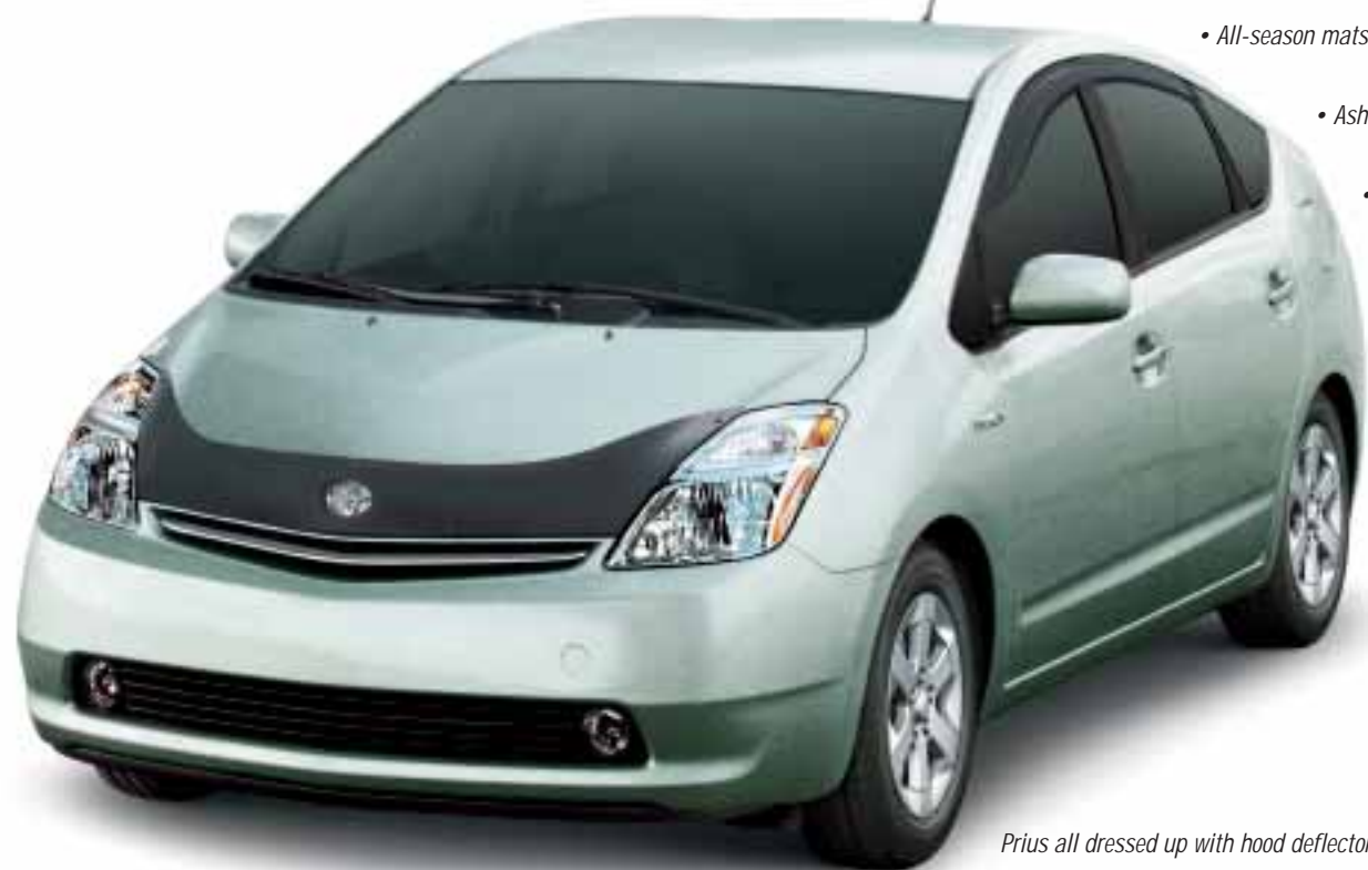
Prius all dressed up with hood deflector and side window visors.