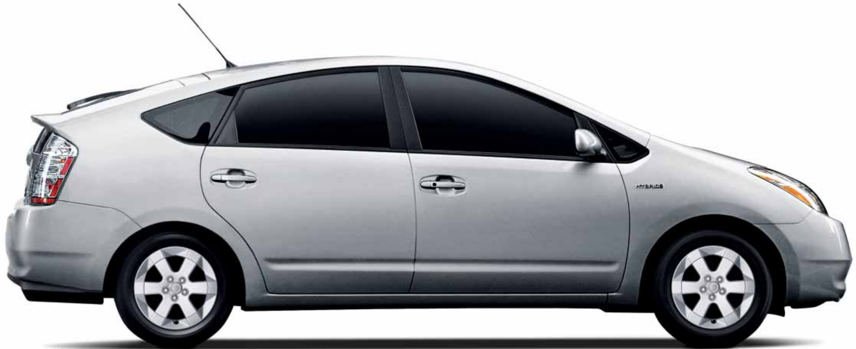
Above: The 2006 Prius shown in Classic Silver Metallic.

SO MUCH MORE THAN MEETS THE EYE. WELCOME TO THE 21 ST CENTURY.