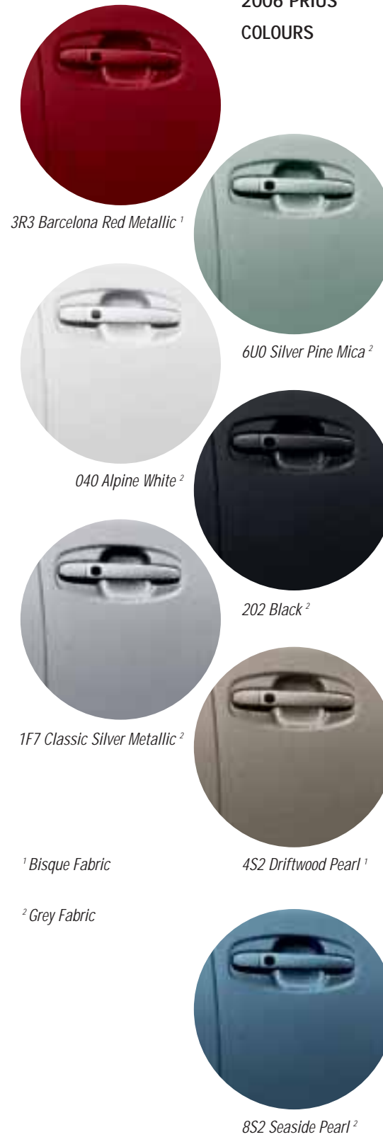
3R3 Barcelona Red Metallic 1