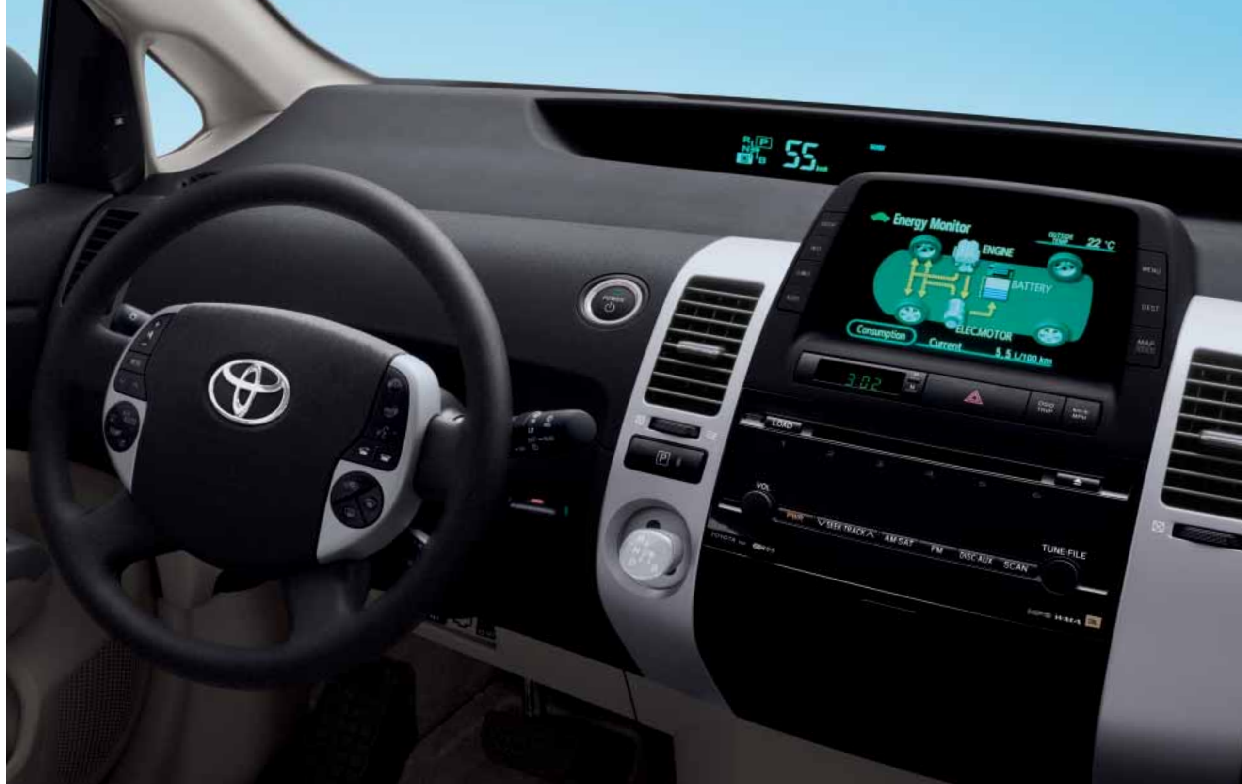
Above and right: Prius dash and detail images shown with optional equipment.

The Prius experience goes well beyond first impressions. Something you'll discover when you settle in behind the wheel and encounter a jaw-dropping array of amenities. Like an amazingly sensible push-button starter. Or steering wheel-mounted controls and available Smart Entry & Start, which lets you magically unlock and start your car without even using the key. You can even take in the wonders of Hybrid Synergy Drive™ on an in-dash display screen. And as if Prius isn't already the most technically advanced car in its class, there's an available DVD-based navigation system 1 with back-up camera, a JBL premium AM/FM and a 6-disc CD autochanger with 9-speakers for a sound you – and your ears – simply will not believe. Prius. Another word for “tomorrow.”