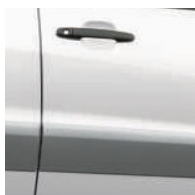
Natural White 1 with Gray or Taupe 2 interior