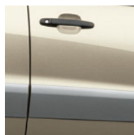
Vintage Gold Metallic 1, 2 with Taupe 4 interior