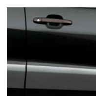
Black with Gray or Taupe 4 interior