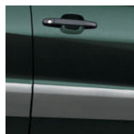
Rainforest Pearl 2 with Gray or Taupe 4 interior