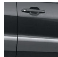
Graphite Gray Pearl 5 with Gray 4 interior