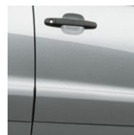
Titanium Metallic 2 with Gray interior