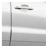
Frosted White Pearl 3 with Gray or Taupe 4 interior