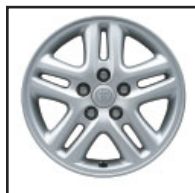
Available split 5-spoke aluminum alloy wheel 2