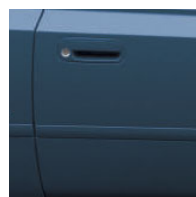
Indigo Ink Pearl 6 with Charcoal or Ivory interior