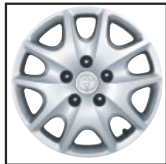
SE standard 15" steel wheel with wheel cover