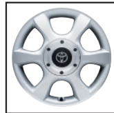
SE V6 Appearance Package available 16" aluminum alloy wheel