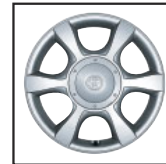
SE V6 available 16" aluminum alloy wheel