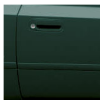
Rainforest Pearl 6 with Charcoal or Ivory interior