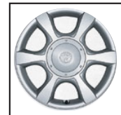
SLE V6 standard 16" aluminum alloy wheel