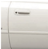
Diamond White Pearl 5 with Charcoal or Ivory interior