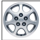
SE available 15" aluminum alloy wheel