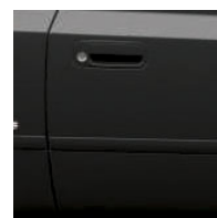
Black Sand Pearl with Charcoal or Ivory interior