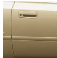
Gold Dust Metallic with Ivory interior