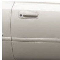
Lunar Mist Metallic with Charcoal interior