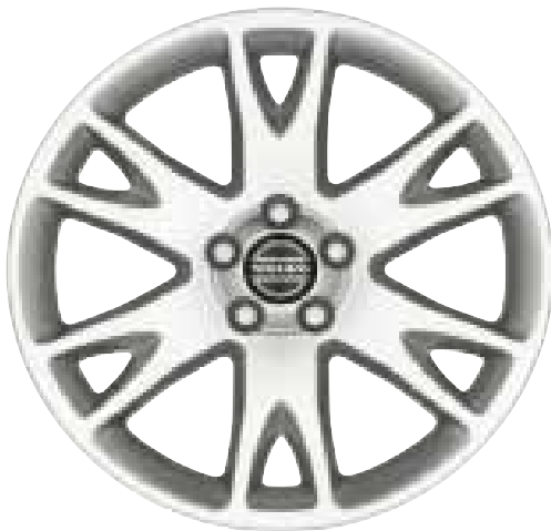
7x18" ATLANTIS alloy wheels 235/60/18 tires (Option)

Electronic immobiliser. Remote controlled central locking. Approach and Home Safe lighting. A remote controlled alarm is available as an option.