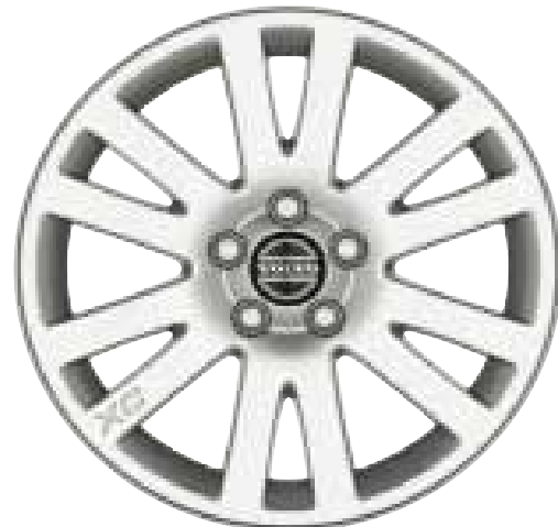
7x17" ANTAEUS alloy wheels 235/65/17 tires (Standard)