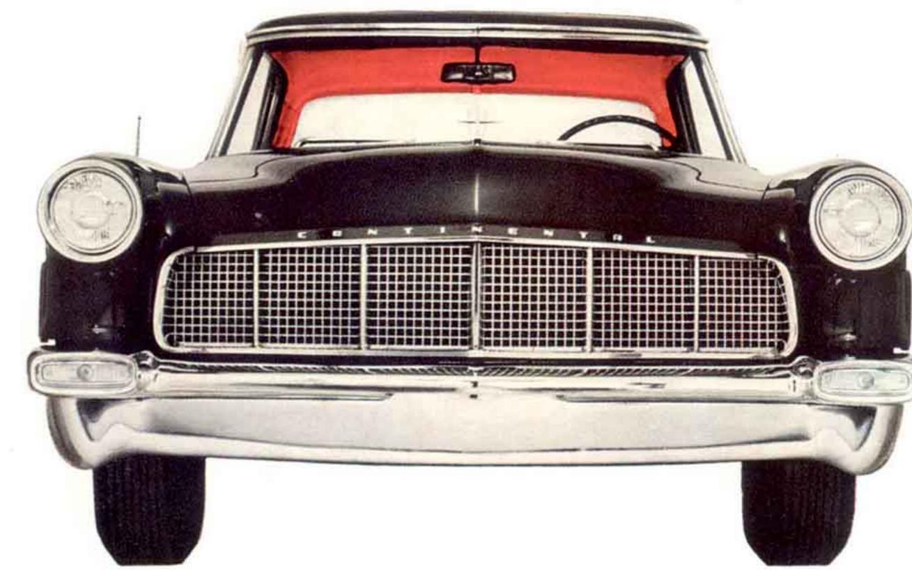
the Continental Mark II