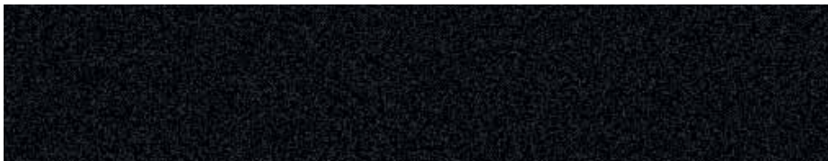
TUXEDO BLACK METALLIC