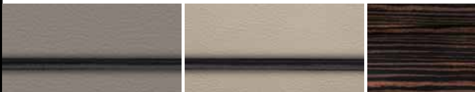
STONE OR CAMEL LEATHER WITH CHARCOAL BLACK INSERTS AND BLACK PIPING | EBONY WOOD

Camel Leather trim is offered with: Tuxedo Black, White Platinum Tri-Coat