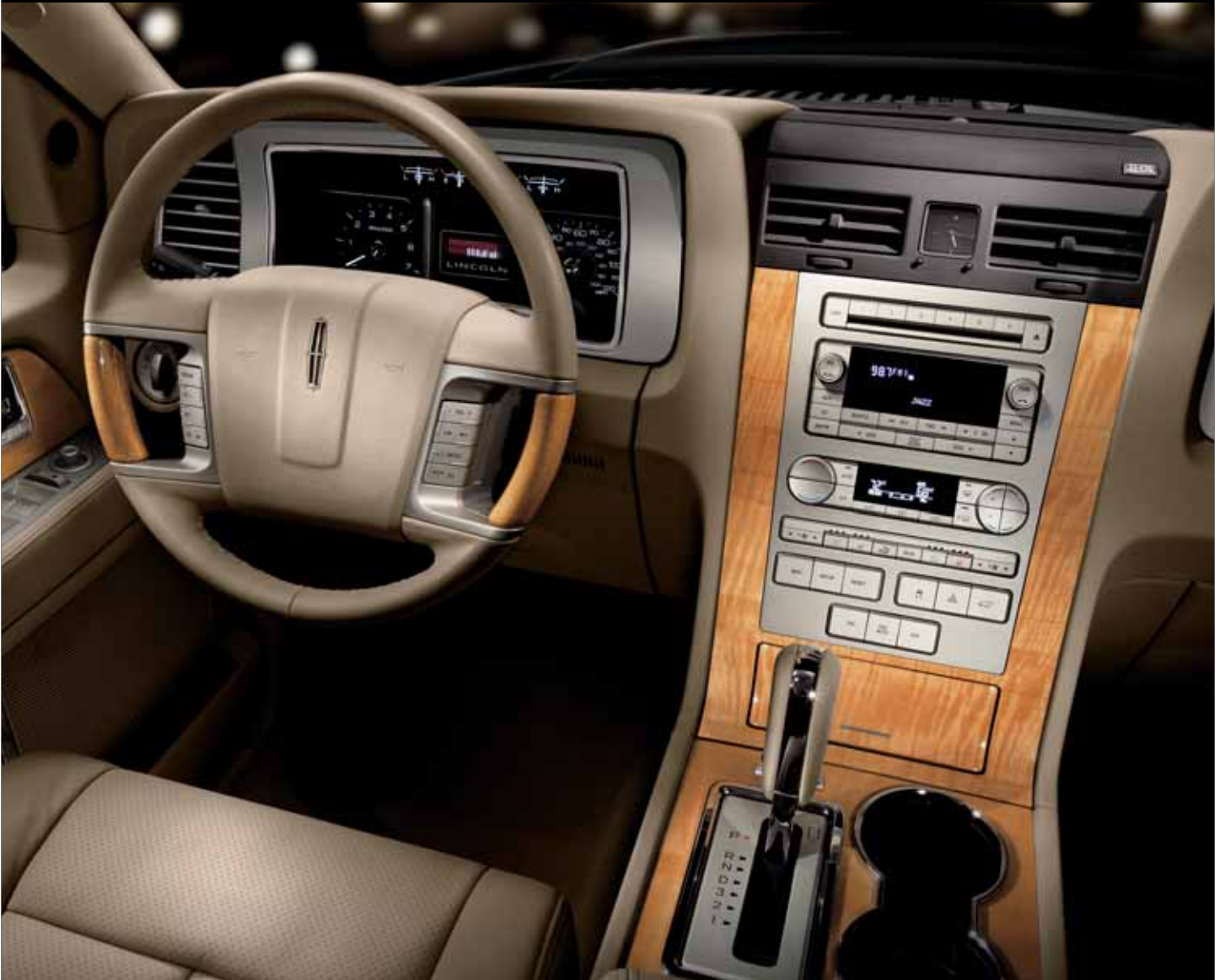
Lincoln Navigator leather-trimmed seats in Camel, Figured Maple wood trim. Shown with available equipment.