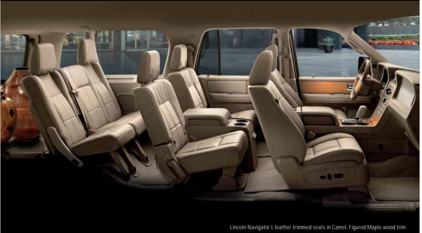
Lincoln Navigator L leather-trimmed seats in Camel. Figured Maple wood trim.