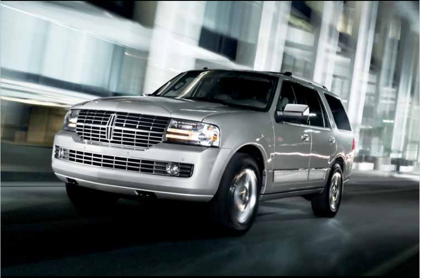
Lincoln Navigator in Ingot Silver Metallic with available equipment.

POWER TRIP. The 2010 Lincoln Navigator and Navigator L. Power-deployable running boards extend automatically whenever you open a door. A Rear View Camera displays what's behind you when backing up, while a virtual assistant handles your calls and music. Power-folding sideview mirrors, a power liftgate, and a PowerFold® 3rd-row seat offer additional assistance.