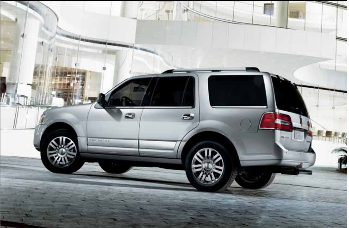
Lincoln Navigator in Ingot Silver Metallic with available equipment.