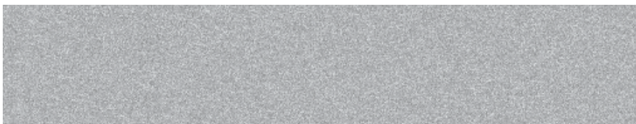
INGOT SILVER METALLIC