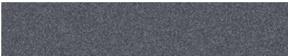
STERLING GREY METALLIC