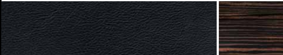
CHARCOAL BLACK LEATHER | EBONY WOOD

Charcoal Black Leather trim is offered with: Tuxedo Black, Sterling Grey, Ingot Silver, White Platinum Tri-Coat