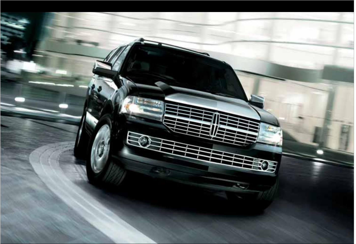
Lincoln Navigator in Tuxedo Black Metallic with available equipment.