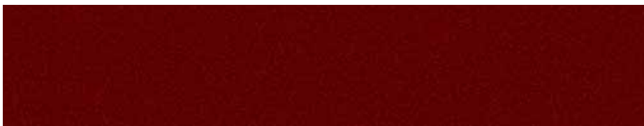
ROYAL RED METALLIC