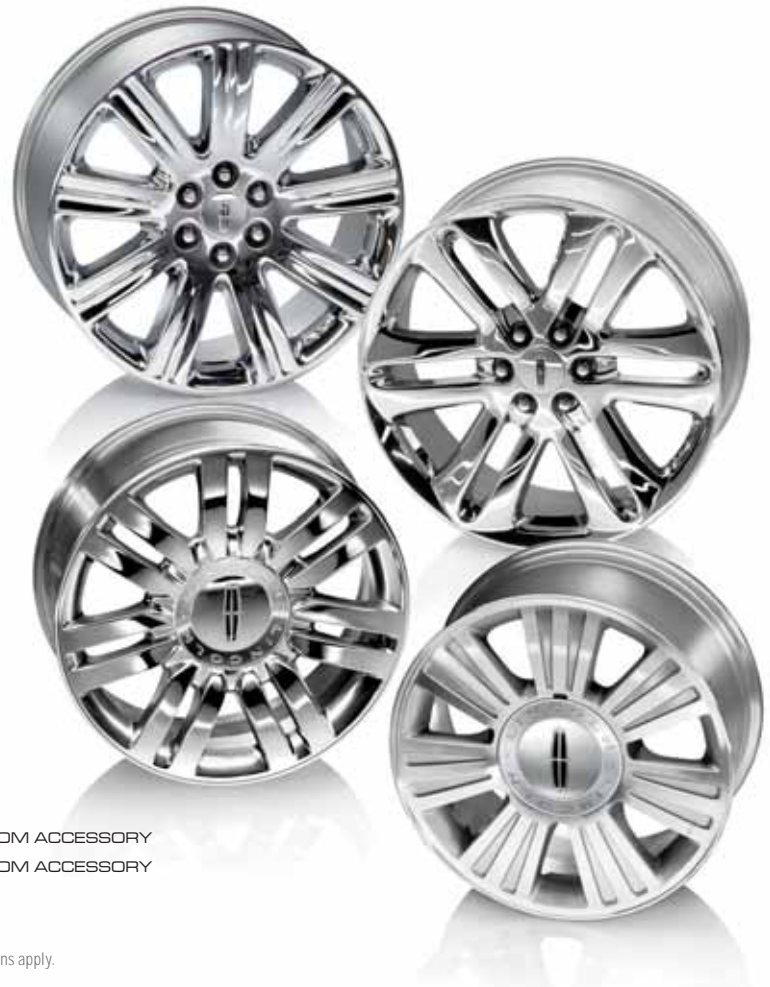
Top to bottom: 22" CHROME CAST-ALUMINUM 1 | AVAILABLE AS A LINCOLN CUSTOM ACCESSORY 22" CHROME CAST-ALUMINUM 1 | AVAILABLE AS A LINCOLN CUSTOM ACCESSORY 20" 7-SPOKE CHROME-ALUMINUM | AVAILABLE 18" 7-SPOKE ALUMINUM | STANDARD

1 Only available on Navigator L and Navigator 4x4. Additional equipment required. Vehicle restrictions apply. See your local dealer or visit Tech Specs on lincolnaccessories.com for more details.